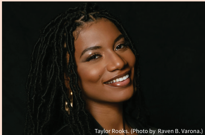
Taylor Rooks.

Taylor Rooks (BS '14, journalism), sports journalist and broadcaster at Bleacher Report, is known in the field of sports journalism for her interviewing skills and for her ability to connect with athletes. She was nominated for a 2022 Sports Emmy Award for "Outstanding Personality/Emerging On-Air Talent."