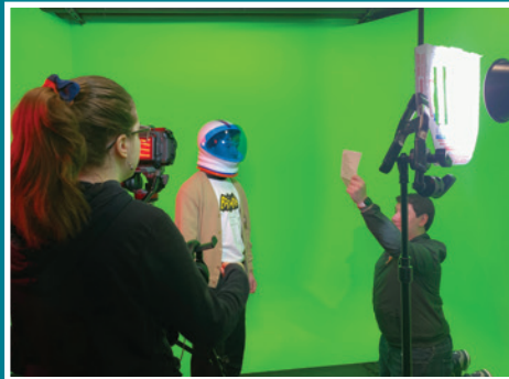
During Mediapalooza 2022—an event for first-year students admitted to the College of Media—students in the media and cinema studies major tried out the new production studio equipped with a green screen in the basement of Gregory Hall for some “MACS Movie Magic.”