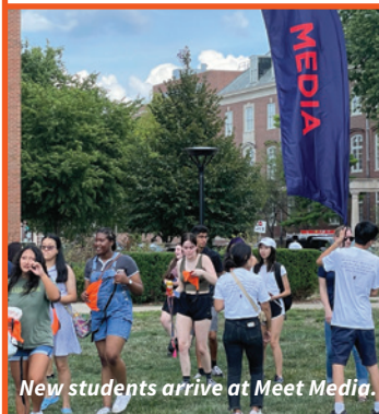
New students arrive at Meet Media.

Yearly cost of attendance for a student taking 16 credit hours as an Illinois resident