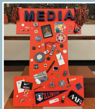
A Block I representing the College of Media showed off our school spirit during Homecoming week.